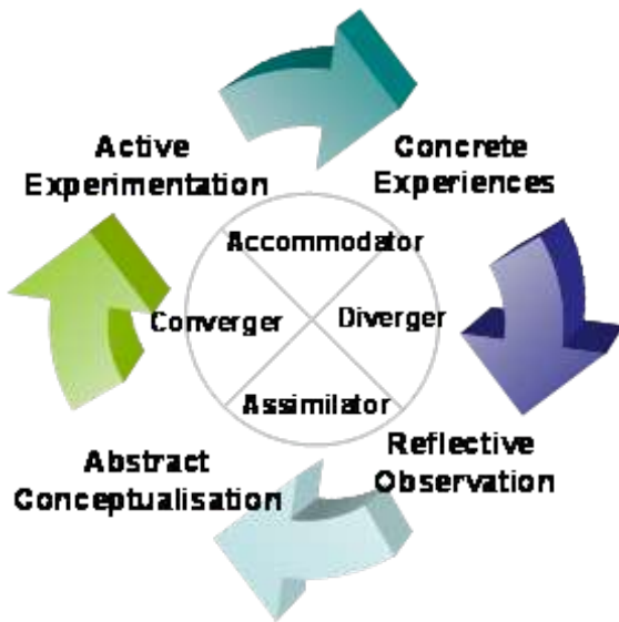
Kolb's learning cycle